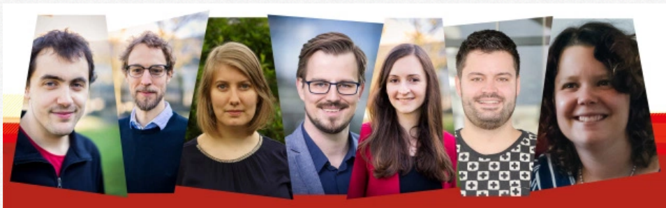
Memprise Winners

The winning solution was developed by a team from Radboud University and Radboud University Medical Centre, based in Nijmegen in the Netherlands, and tested on over 10,000 Memrise learners that volunteered to take part in the experiments.